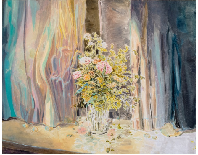
too heavy to fall, oil on canvas, 120 x 150 cm, 2022