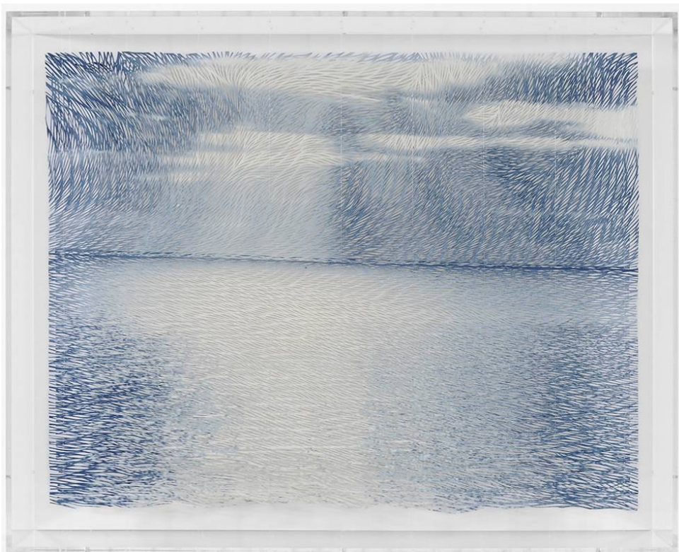
Georgia Russell, Double Horizon , Mixed Media in Acrylic Box, 80 H x 100 W x 19 D cm, 2012

Georgia Russell's mixed media installations are based on the sculpting of paper works.