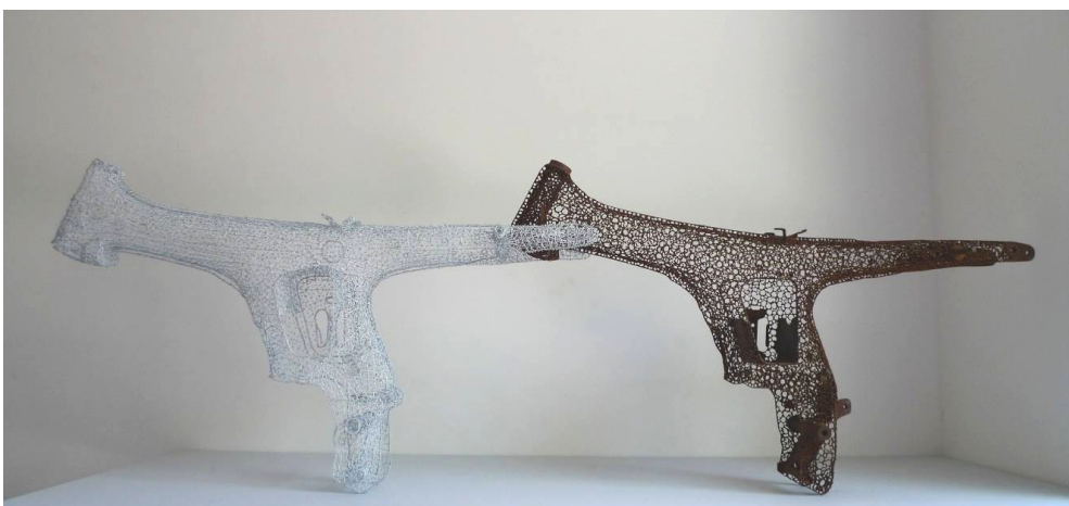
Shi Jindian, Two Birds , Painted Stainless Steel Wire, Metal, 62 H x 186 W x 25 D cm each, 2011

Shi Jindian was born in 1953 in China's Yunnan Province. He studied at the Sichuan Fine Arts Institute and currently lives and works in Chengdu. Shi Jindian's works can be found in the collections of prominent museums and organisations including The Montpellier Contemporary Chinese Art Biennale, France; Seoul Art Museum, Korea and The White Rabbit Contemporary Chinese Art Collection, Australia.